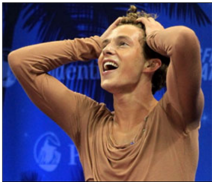
Adam Rippon hopes to improve on his silver medal from last year's U.S. championships.